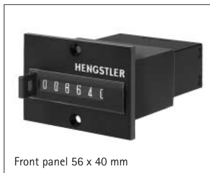
Front panel 56 x 40 mm